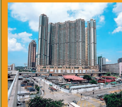
Pacifica Tower in Hong Kong