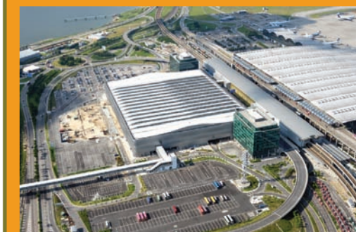
Hong Kong Airport SkyPlaza