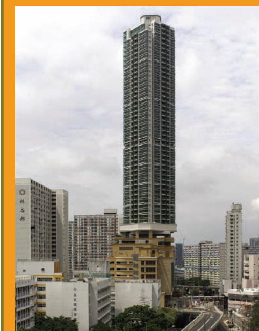
Clear Water Bay Road No. 8 Project in Hong Kong